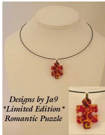
Designs by Ja9 *Limited Edition* Romantic Puzzle

A cherry red puzzle piece adorned with scrolls of beautiful gold/orange/pink dichroic glass suspended from a silver or gold plated hanging loop.